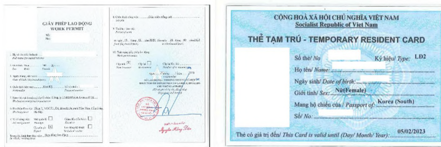
Image of Work Permit Temporary Residence Card of Point Avenue performed by TrueLaw.